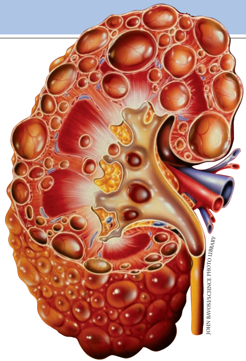
Figure 2. A polycystic kidney. Normal cells lining the tubule start to grow abnormally. The tubule balloons out, forming a cyst which eventually detaches from the tubule. Cysts may form to be many centimetres in size. Eventually the whole kidney becomes enlarged and replaced with cysts

PKD mainly affects the tubules of your kidney. Each tubule is about the width of a human hair and made up of a lining of cells called tubular epithelial cells, each of which contains two copies of the PKD genes, which we think regulate the growth of cells to maintain the normal structure of the tubule. If one of these copies carries a mutation, then the cells start to grow abnormally and the tubule starts to balloon out, forming a cyst (see Figure 2). In PKD there are hundreds of these cysts in each kidney. As they slowly grow, they start to compress the surrounding kidney and eventually impair the flow of blood and urine within the kidney, causing kidney failure.