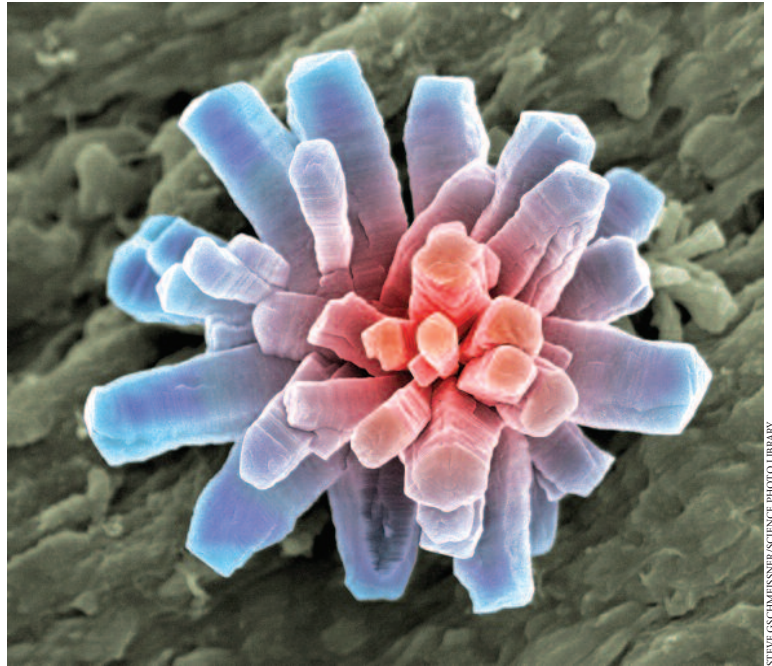
A crystal of calcium phosphate. If their levels rise too high, calcium and phosphate can deposit in the blood vessels, requiring medical management

Very low calcium levels in the body can result in adverse effects such as muscle twitching and spasms, especially in the face and arms, whereas