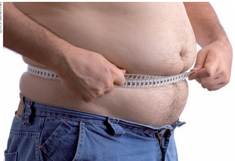
Health risks begin to increase once waist circumference exceeds 94 cm (in men) or 80 cm (in women)